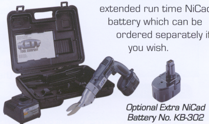
Optional Extra NiCad Battery No. KB-302

There's room for an extra extended run time NiCad battery which can be ordered separately if you wish.